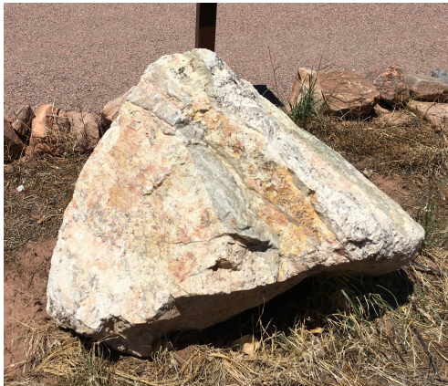
The muscovite granite pegmatite is 1.4 billion years old and was quarried near Howard.

Mountain Masonry also moved a large muscovite granite pegmatite boulder to its proper position along the Geology Time Trail.