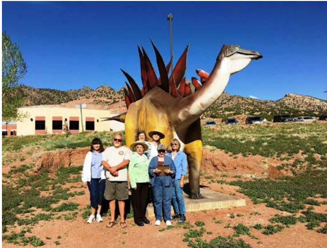
Fremont County Historical Society Board members with CTT members April 24, 2017, celebrating the Trail