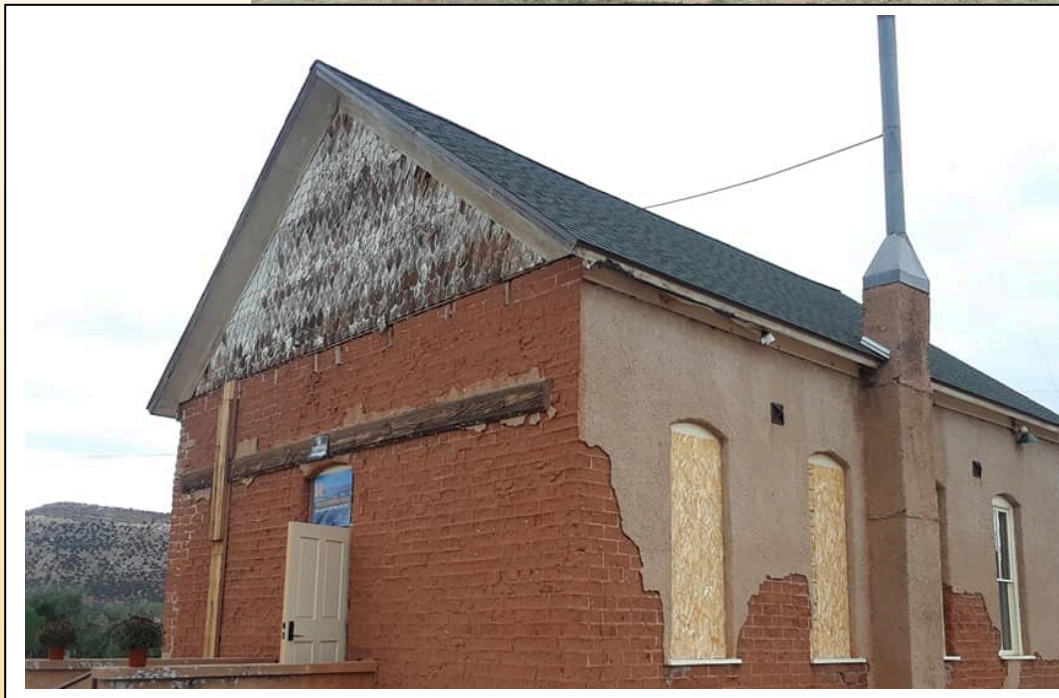
GARDEN PARK SCHOOL ON RED CANYON ROAD ON THE WAY TO DINOSAUR DESIGNATION AREA WHICH IS A NATIONAL NATURAL LANDMARK

Your Fremont County Historical Society donated $100.00 in 2014 - and $2,000.00 to this project in January 2019.