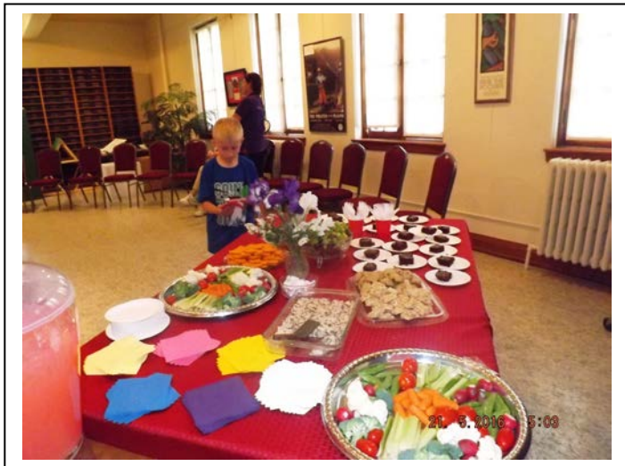
ABOVE: The Rudd family timeline and travels was very carefully researched by the students, with the help of the staff. LEFT: The Friends furnished sustenance for the crowd to enjoy during their visit to the exhibit. BELOW: A family who came to see what their student accomplished.