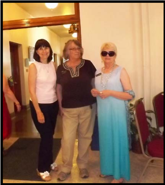
Ladies enjoying the movies and "Tom Mix"